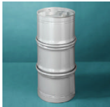
Seamless Stainless Steel