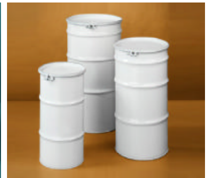
Type A-7A Drums