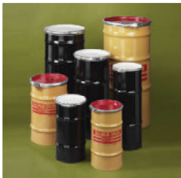
Quick Lever Drums