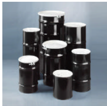
Carbon Steel Drums