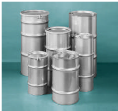
Stainless Steel Drums