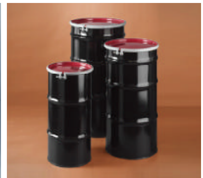
PIH Overpack Drums